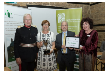
Winner of Best Large Village East Hunsbury

Congratulations to all our winners, the standards were very high. The judges very much enjoyed their visits to all the villages and were very impressed by the variety of activities taking place in them, the involvement and community spirit that was shown by all and how welcome they made the judges feel.