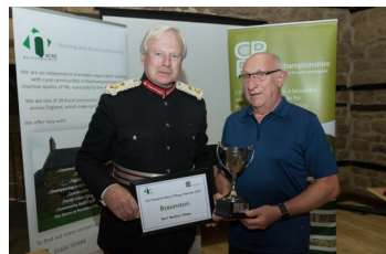
Winner of Best Medium Village Braunston